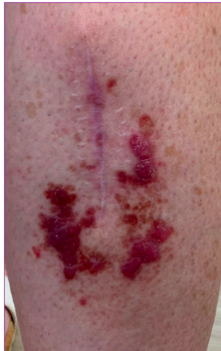
Figure 2. Recurrence of RDD surrounding previous excision site