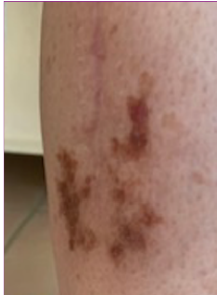
Figure 3. Improvement of RDD following 2 rounds of ILK injections

methotrexate, dapsone, vincristine, acitretin, interferon, rituximab, chemotherapy, cryotherapy, and radiation therapy. 2,4 Several of these therapies have been reported for cutaneous RDD to be helpful, with effects varying from mild to total improvement. 4 Localized disease has been treated with surgical excision or cryotherapy. 4 Topical and intralesional corticosteroids and topical imiquimod have shown beneficial effects in some cases. 4