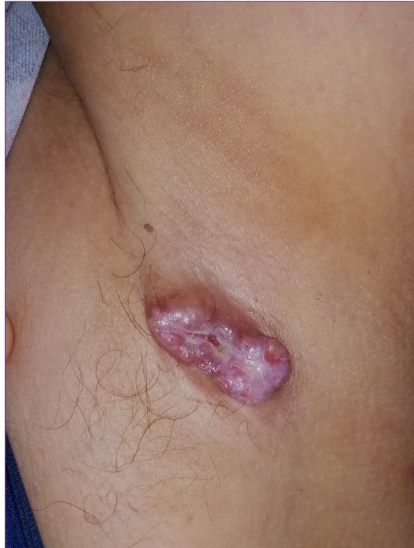
Figure 1. Reddish multi-lobed nodule with overlying central ulceration on the left axillary fold