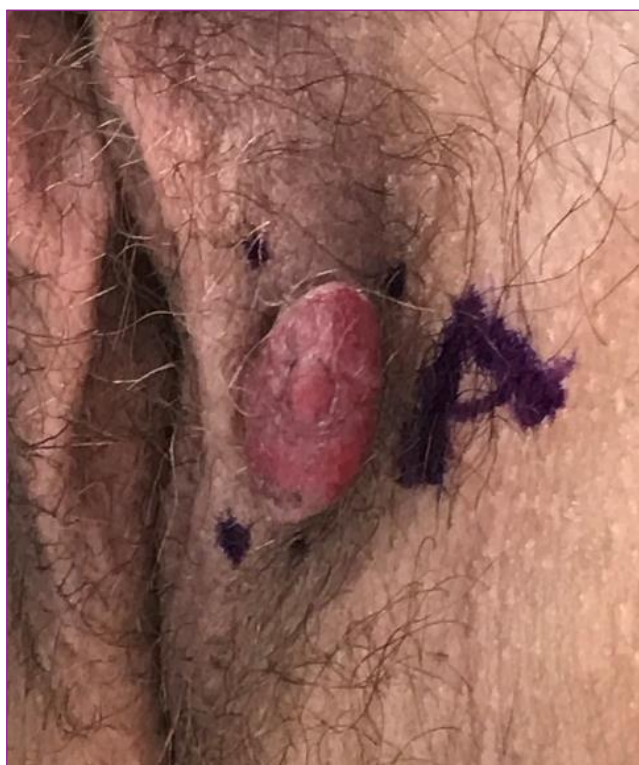
Figure 2. Venous malformation with the morphology of a friable plaque on the left labia majora.