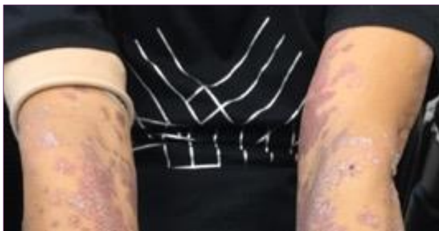
Figure 1. Presentation of psoriasiform dermatitis after 14 doses of pembrolizumab. The bilateral arms demonstrated well demarcated erythematous papules and plaques with overlying silvery scale.

Dermatology given persistence of his rash. He had well defined erythematous papules and plaques with silvery scale involving approximately 20% body surface area consistent with a psoriasiform dermatitis (Figure 1).