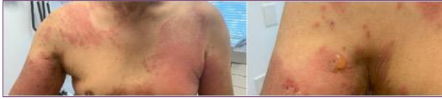
Figure 3. Well defined erythematous papules coalescing into plaques covering approximately 60% BSA with several tense bullae with serosanguinous fluid and superficial erosions atop the plaques.

USCF PSTC in late July 2020, with generalized, pink plaques with a violaceous hue involving approximately 60% body surface area (Figure 3).