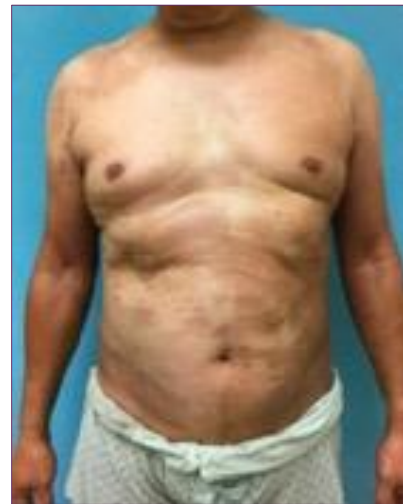
Figure 4. Six weeks after starting Goeckerman Therapy demonstrating clear skin with post-inflammatory hyperpigmentation and with no new bullae

new blisters while on Goeckerman treatment (Figure 4). He discontinued Goeckerman treatment after approximately two months total of treatment and with discontinuation had recurrence of skin blistering approximately two months later, which again resolved with Goeckerman therapy (without phototherapy). As of this writing, he has completed an additional 23 days of Goeckerman therapy with resolution of blisters and near resolution of rash.