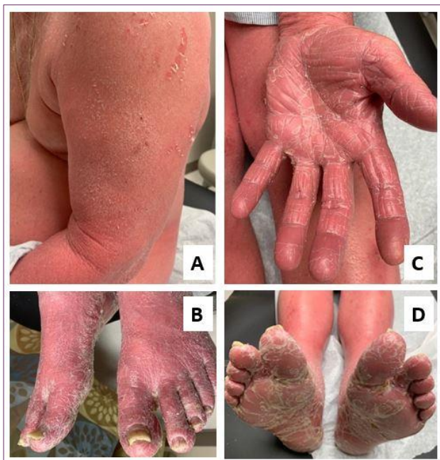
Figure 1. A) Pictured is the patient's red orange (salmon) colored erythema and fine flaky scaling involving 95% of his body surface B) There is bilateral toenail and fingernail plates with yellowing, thickening, subungual debris and onycholysis with no pitting B-D) There is evident palmar-plantar hyperkeratosis and waxy keratoderma.

erythrodermic drug eruption, erythroderma secondary to malignancy, and PRP. Labs revealed 19% eosinophils and a