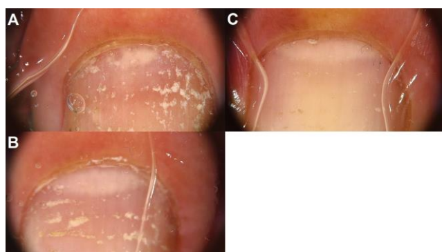
Figure 1. Case 1 A) Before treatment B) Progressive improvement after five C) and ten months of treatment

A 42-year-old male presented with adult-onset, mild changes in nail appearance and texture. Physical exam showed pitting in the left small fingernail, right thumbnail, and right index fingernail plates. A diagnosis of psoriasis of the nail was established, and global/microscopic pictures (executed with FotoFinder medicam dermoscopy) were obtained to document the nail changes at baseline (Fig 1, A). The patient was subsequently prescribed daily Cal/BD aerosol foam. On five- and ten-month follow-up exams, dermoscopy demonstrated a decrease in nail pits and an improvement of nail plate surface abnormalities (Fig 1, B, C).