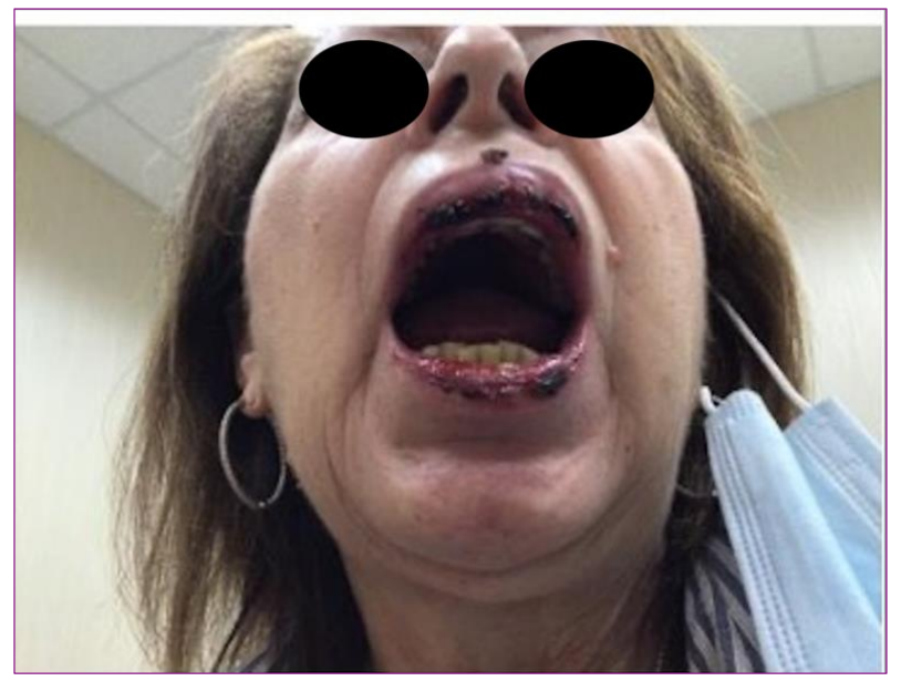
Figure 2. Two-week follow-up. Erosions and ulcers on her tongue and mucosal lower lip.