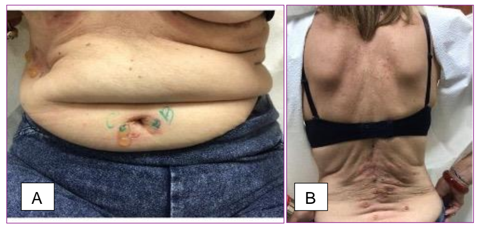
Figure 1. Initial visit. erythematous vesicles, bullae, and erosions located on anterior abdomen (1A) and lower back along the T9 and T10 dermatomes (1B).