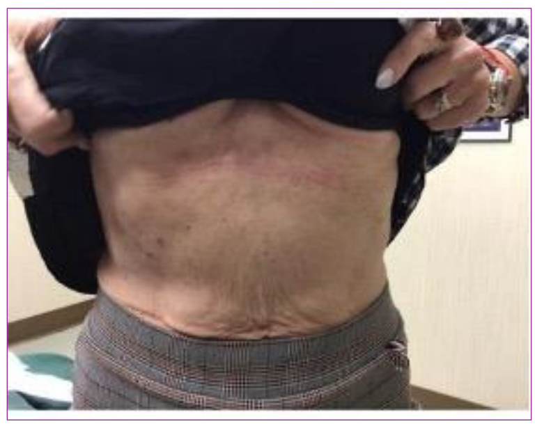
Figure 4. Post-treatment with dapsone.

genetic predisposition and environmental factors.4 Some of these environmental factors include recent infection. immunization, malignancy, and certain medications containing thiol groups such as penicillamine and captopril. 5,6 An association between certain immunizations and the autoimmune development of bullous diseases like pemphigus vulgaris and bullous pemphigoid has been studied established over the past 25 years.<sup>7</sup> A systematic review by Kasperkiewicz et al explains that the administered for rabies, influenza, hepatitis B, typhoid, tetanus, and anthrax have all been implicated in the development of pemphigus vulgaris, but at the time of writing it had not yet been seen after COVID-19 vaccines.<sup>7</sup> Our patient did not have a personal or family history of autoimmune disease, was not recovering from illness or infection and did not take any medications known to precipitate the onset of pemphigus vulgaris, such as penicillamine or captopril.