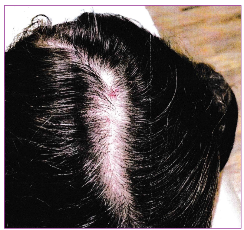
Figure 1. An 8x15 mm pink, scaly plaque on the left posterior scalp of a middle-aged woman.