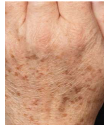
Subject 1 Baseline

40% reduction In VAS ( p < 0.001 ) vs 2% reduction in non-treatment arm p < 0.245 )