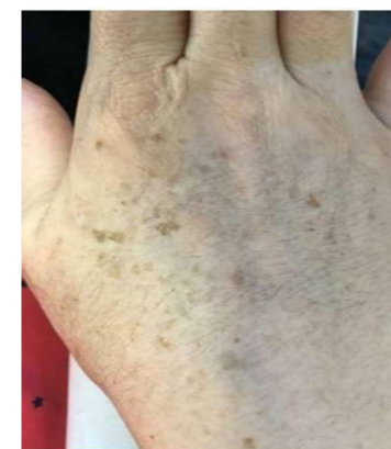
Subject 2 Baseline